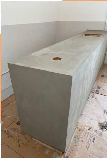
Skimmed concrete coffee bar