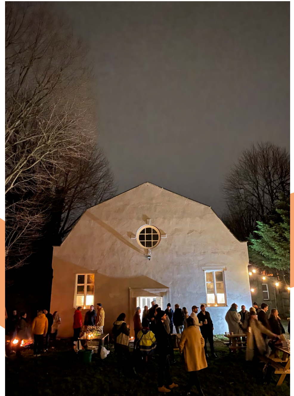
Exhibition launch night