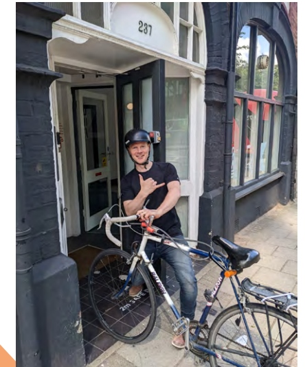
Handing keys in day