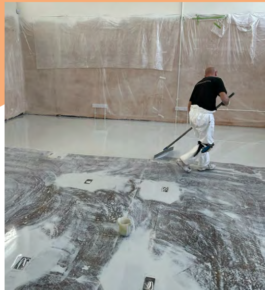
Pouring the resin floor into the hall