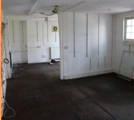
KX House when we took the building on...

Saying goodbye to KX House, our home of six years based on Pentonville Road