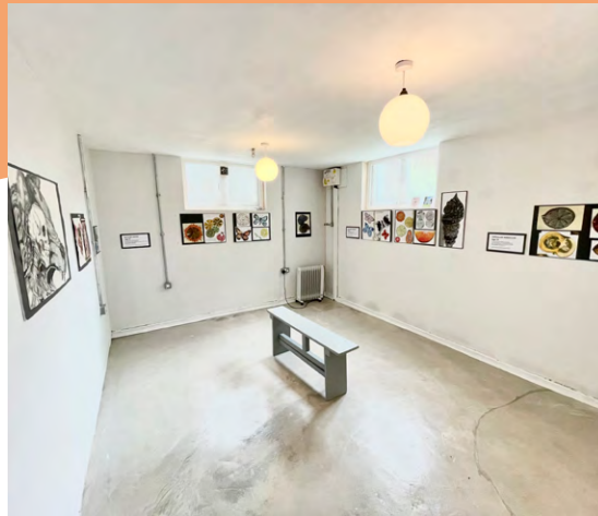
AMSI art exhibition up at St Saviour's in coordination with the Islington Cultural Enrichment team