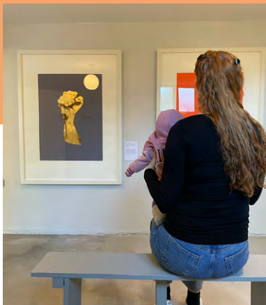
Our first exhibition by Nicola Green