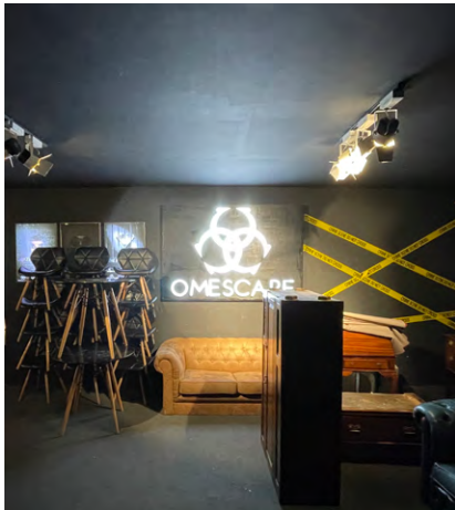
The cafe left from the previous tenants

In April 2022 work started on renovating the old church building to be our new home.