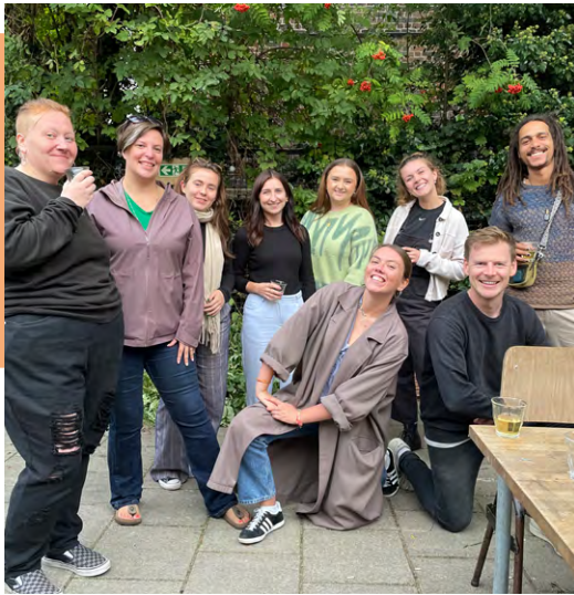
Members new and old moving in