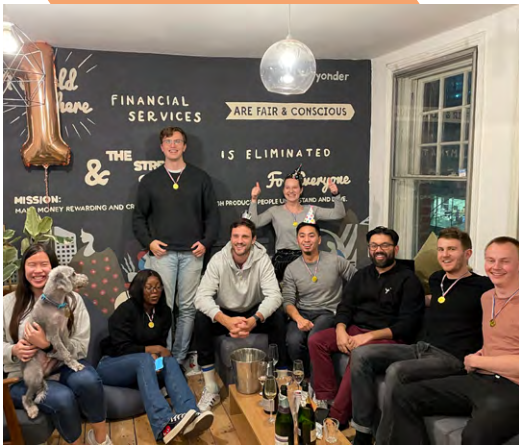
The Yonder team celebrating their 1st birthday