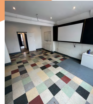
Goodbye boardroom ♥