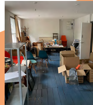
May 2022 Last orders