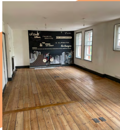
...and when we left it six years later